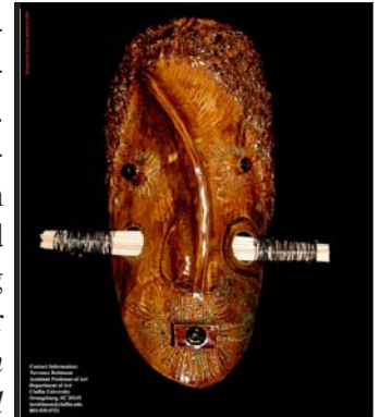
One of the works presented at the exhibition