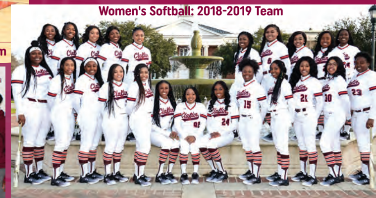
Women's Softball: 2018-2019 Team