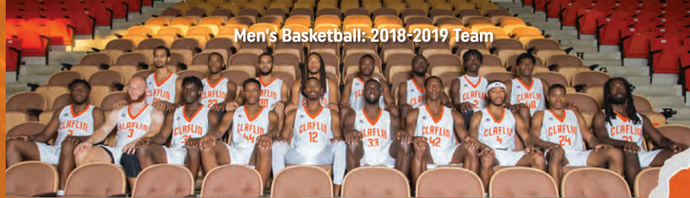
Men's Basketball: 2018-2019 Team