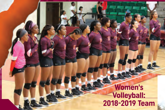
Women's Volleyball: 2018-2019 Team