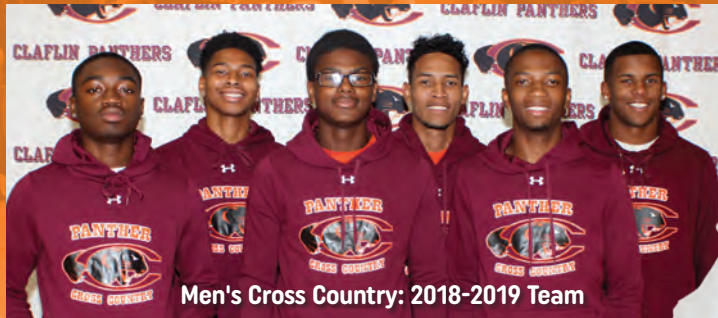
Men's Cross Country: 2018-2019 Team