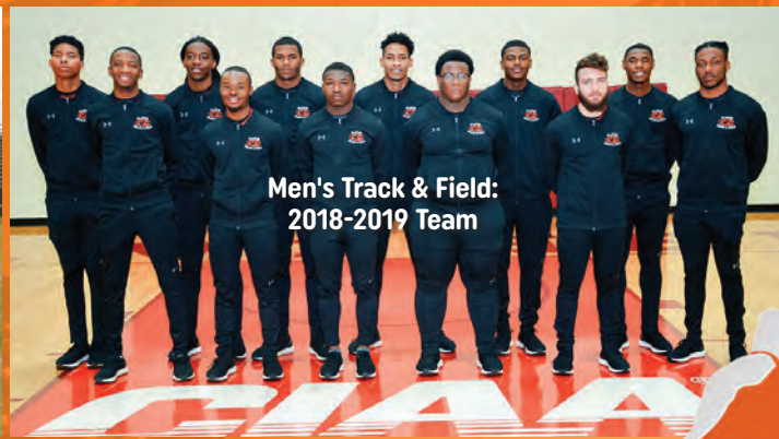
Men's Track & Field: 2018-2019 Team