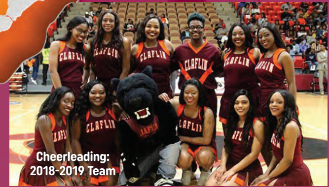
Cheerleading: 2018-2019 Team