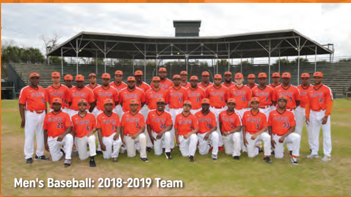
Men's Baseball: 2018-2019 Team