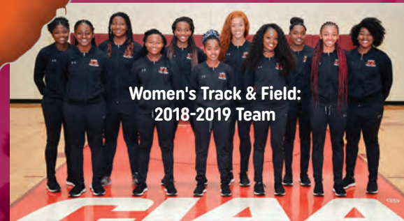
Women's Track & Field: 2018-2019 Team