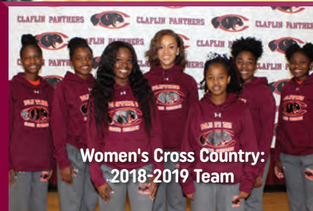
Women's Cross Country: 2018-2019 Team

Claflin University Athletics Department sponsors 11 team sports that compete in National Collegiate Athletic Association (NCAA) Division II. Claflin has 10 sports that compete in the Central Intercollegiate Athletic Association (CIAA). The University's baseball program is a member of the Peach Belt Conference.