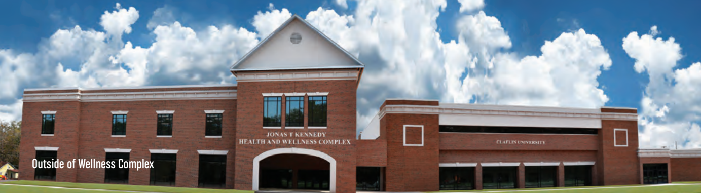
Outside of Wellness Complex