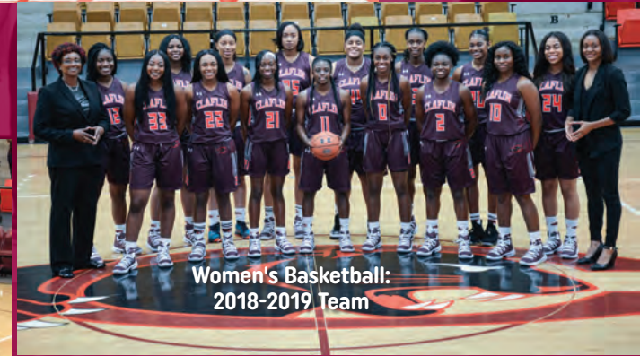
Women's Basketball: 2018-2019 Team