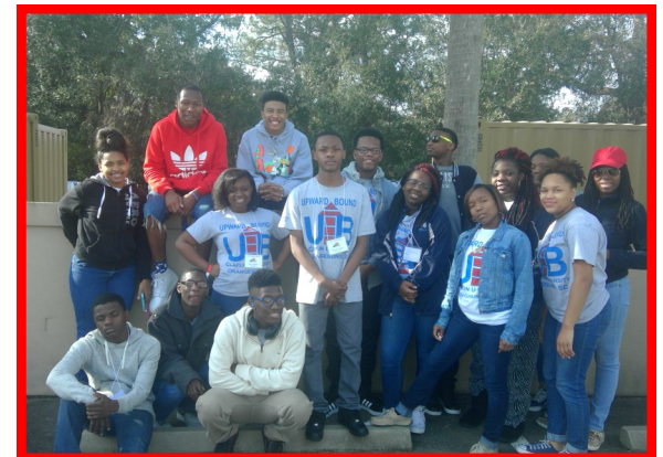
Upward Bound Student Leadership Conference 2017